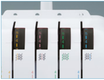
4 colour easy threading guide