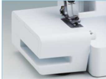
Free arm / Flat bed convertible sewing surface