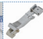
Gathering Foot SA213

For gathering and sewing in one operation.