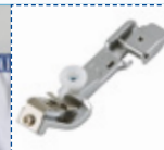
Taping (Elastic) Foot SA212

To attach tapes and elastic to stretch fabrics.