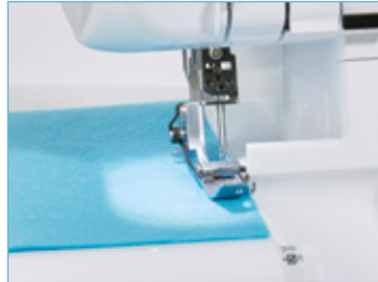
LED work light