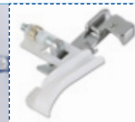
Pearls and Sequins Foot SA211