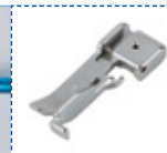
Piping Foot SA210

To attach piping between two layers of fabric.